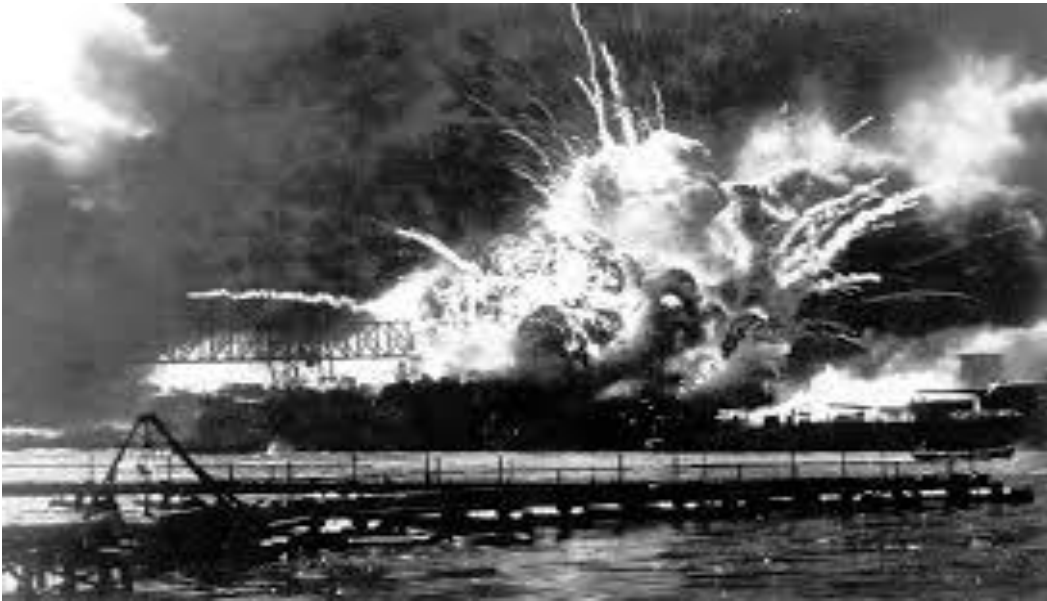
The Japanese attack in Pearl harbor

This year there will be a new addition to the 1MSKMUN conference. The previous year's conference was composed of 6 committees. These were the "ECOSOC", the "SOCHUM", the "Environmental", the "Political", the "Disarmament" and last but not least the Security council committee. However this year a new committee was added called "Historical Crisis committee". The Historical Crisis Committee is a continuous crisis committee, making it quite different from the normal MUN committee. Delegates' decisions and actions will immediately affect the perpetual crisis at hand, and the plots and predicaments that delegates will be asked to deal with are only partially revealed prior to the conference, making for an unpredictable, volatile, and urgent, but undoubtedly exciting, experience. This year's problem will be the Japanese attack on Pearl Harbor in Hawaii which happened on 7 th December 1941. This is an event which changed the course of the World War II as the US joined the allies. We are looking forward to the outcome of this committee.